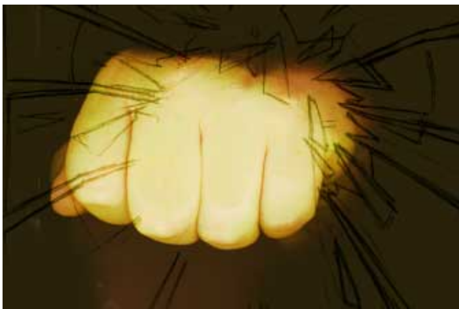
Just your imagination?

To circumvent this difficulty some investigators have examined the impact of imagination on memory for recent experiences where the truth is known. So for example, Goff and Roediger (1998) presented participants with statements (e.g. 'flip the coin') which they actually performed or imagined performing. In a second session they imagined that they had