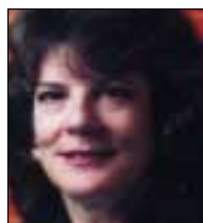
ELIZABETH F. LOFTUS looks at a way that false memories can arise.